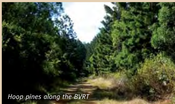
Hoop pines along the BVRT

Ducks, darters and other waterbirds may visit the Brisbane River that runs adjacent to the trail between Moore and Linville. There are often sightings of wedge tail eagles and brown goshawks gliding on the wind searching for their prey in the rural landscapes below. Glossy black cockatoos, brush turkeys, regent bowerbirds and the sulphur-crested cockatoos are often found near Moore and Blackbutt.